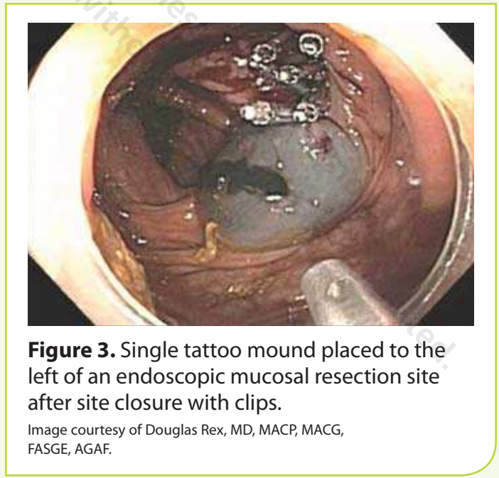
Figure 3. Single tattoo mound placed to the left of an endoscopic mucosal resection site after site closure with clips.

the remaining submucosal injection mound, and note the location in the report (eg, “with the lesion down the tattoo is to the left”). When marking for surgery, the full circumference of the bowel should be marked. The location of the tattoo (eg, “a circumferential tattoo is placed 3 cm distal to the cancer”) should be noted. The endoscopist should be cautious about naming a segment with nonspecific endoscopic landmarks (eg, “the tumor is in the descending colon”).